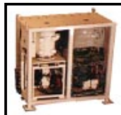
Hydrostatic Power Unit