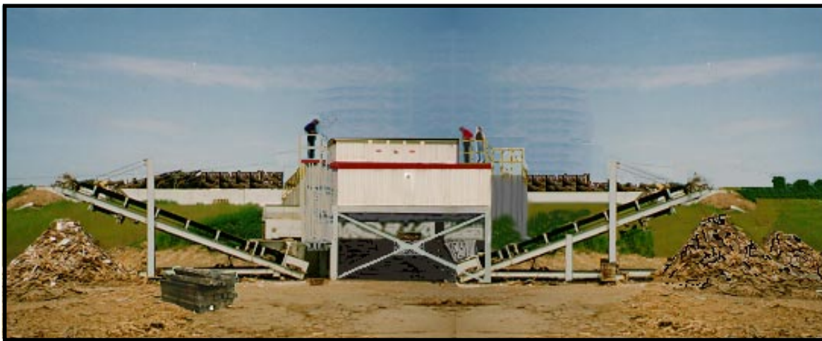
Model THA-12 shown with stand and take away conveyors and material screen for optional fines.

Optional accessories -- see reverse side