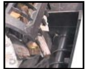
One Screw Processing Chamber

The KOMAR Thor Hydro-Auger Processor providing primary shredding of the most difficult to process waste at the lowest on line operating cost of any volume reduction equipment. It operates at low speed with minimum noise, dust and energy requirements in order to handle high volume of difficult materials including tramp materials.