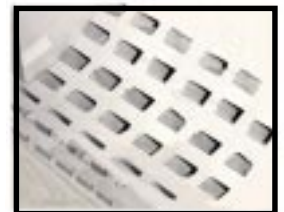
Optional rugged deep section trough screen are designed to provide a positive, fast discharge of fines, while reducing wear and maximizing horsepower.