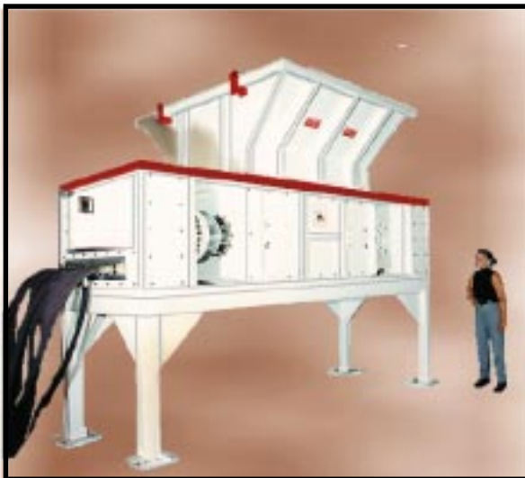
Model 7248-HSS 400 HP shown with bearing drive guards removed.

Optional accessories & additional equipment--see reverse side