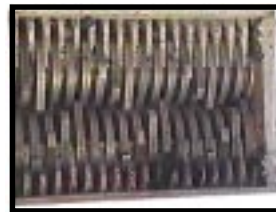
Independent Shaft Drive