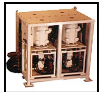
Hydrostatic Power Unit