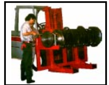
Patented Easy Removable Cutter Cartridge