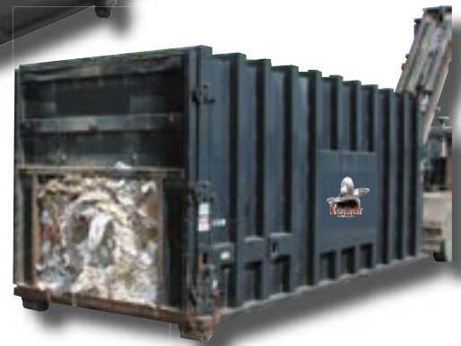
50 cu. yd. roll-off container with up to 14 tons of building material

Unitized system for fast responses & reduced transportation cost. Utilize local hauler for container pick up and transportation of the Komar Mobile Shredder/Compactor to your job site.