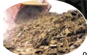
40 cu. yd container with up to 12 tons of Demolition Material

Optional: Power Flip ( switch from generator to 460 Volt, 3 PH., 60 Hz. site power when available)